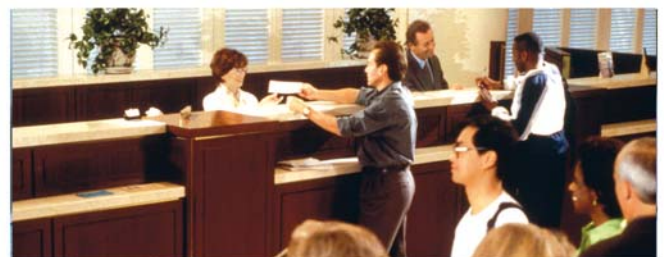
Banking and Finance